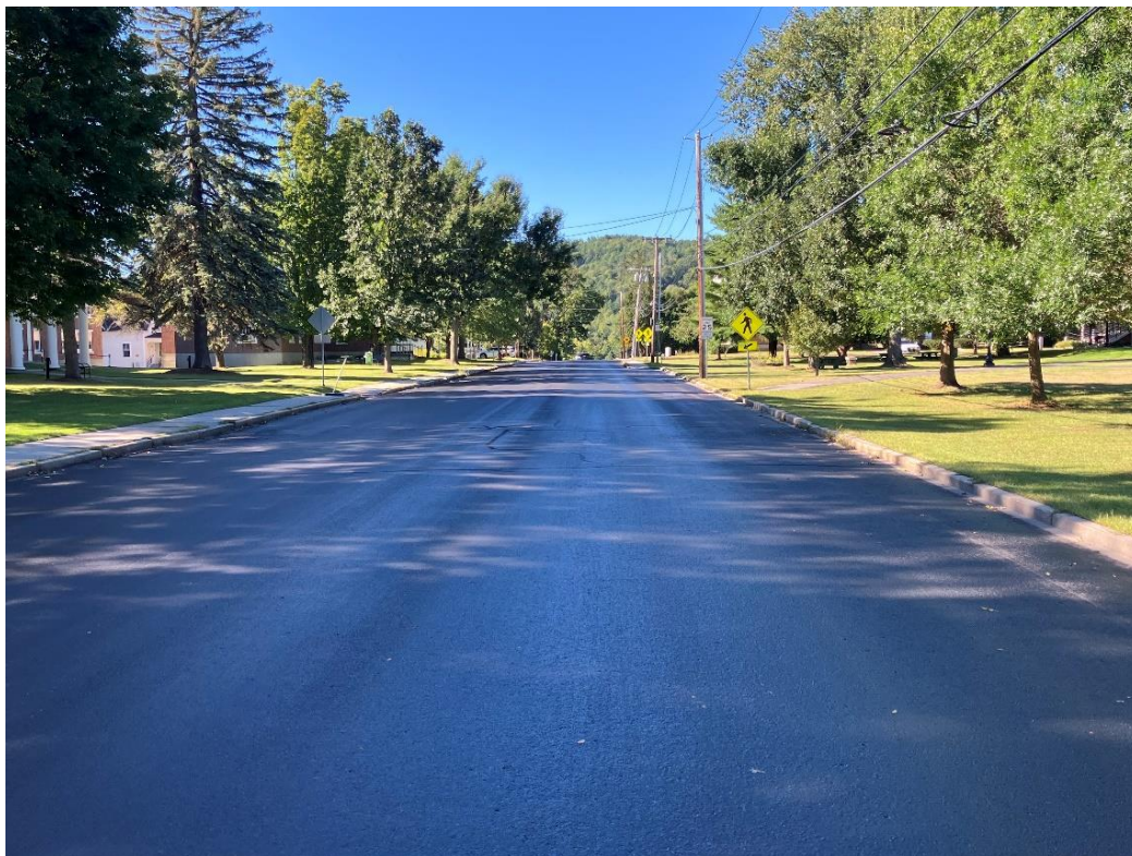
College Street – After Fog Seal application

DPW will be painting crosswalks next week on streets that were recently fog sealed.